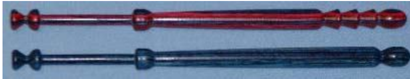
Shape of Midlands Travel/Midlands Jaspé Travel – Birch shown

Honiton – Guatambu (light wood) - length 3 3/4” $1.15 each $11.95/dz Honiton – Rosewood (dark) – length 3 3/4” $19.95/dz